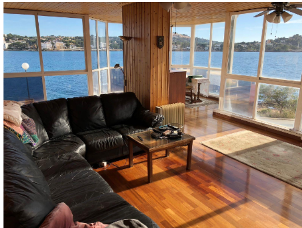
Flat for sale