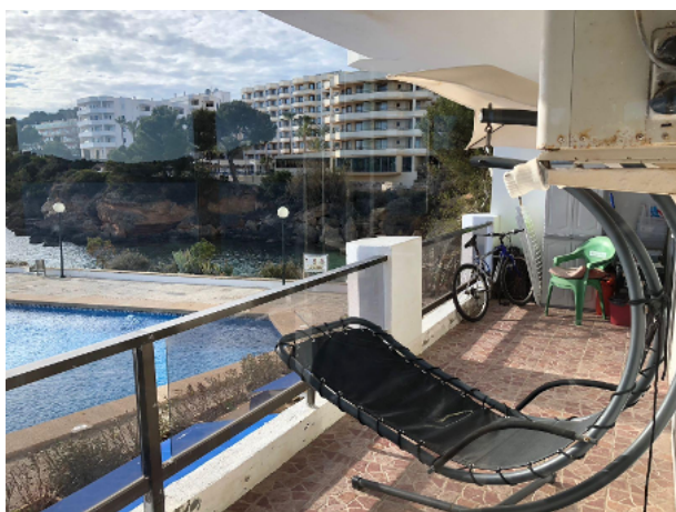
For sale Santa Ponsa