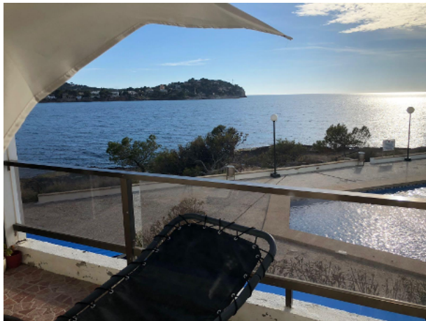
Apartment Santa Ponsa