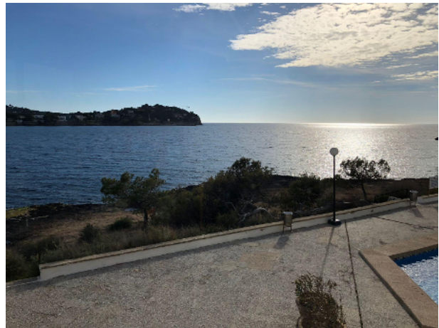
Apartment with sea views